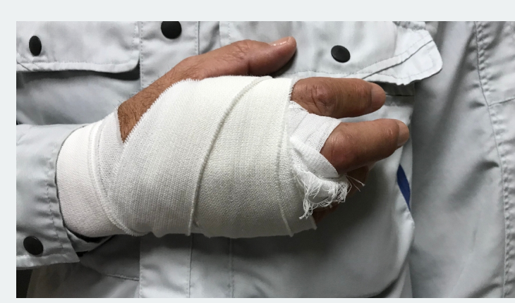
Stutman Law Scores $1.5M Recovery In Workers' Compensation Subrogation Case