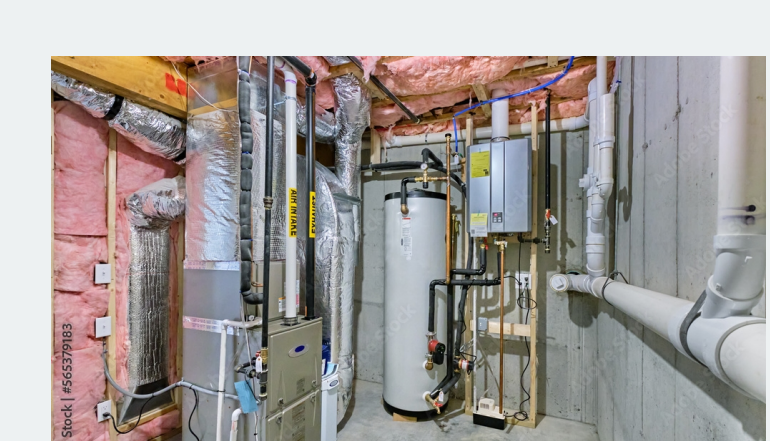
Stutman Law Uses a Furnace to Fire Up a Jury and Obtain a $845,000.00 Verdict