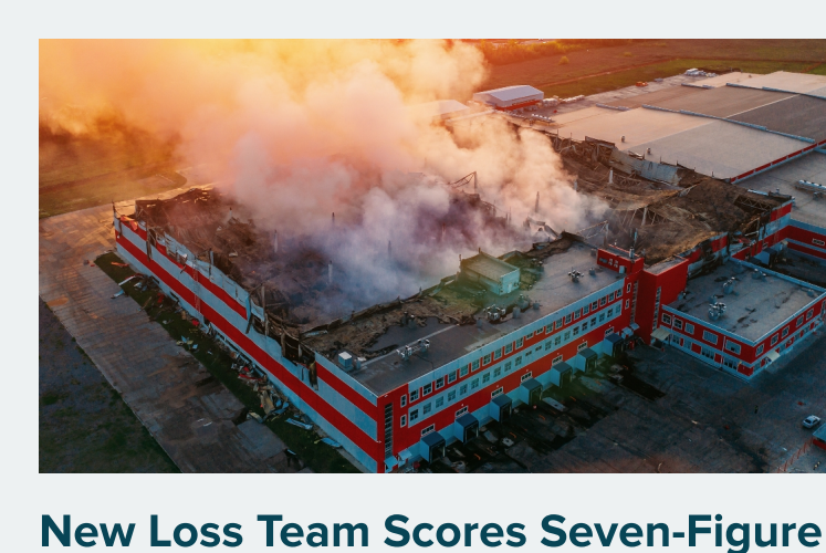
Pre-Suit Recovery Following Michigan Brewery Fire READ ▶