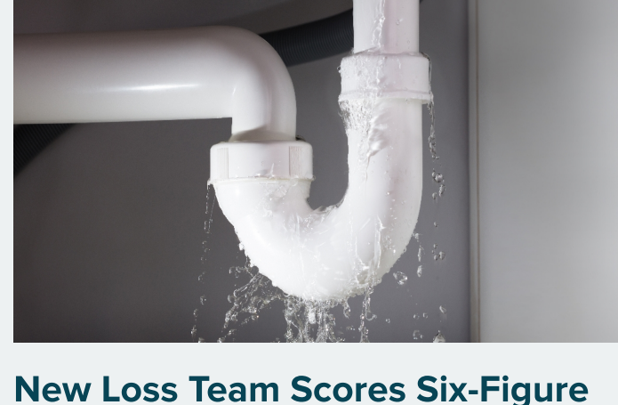
Recovery Despite Lost Evidence