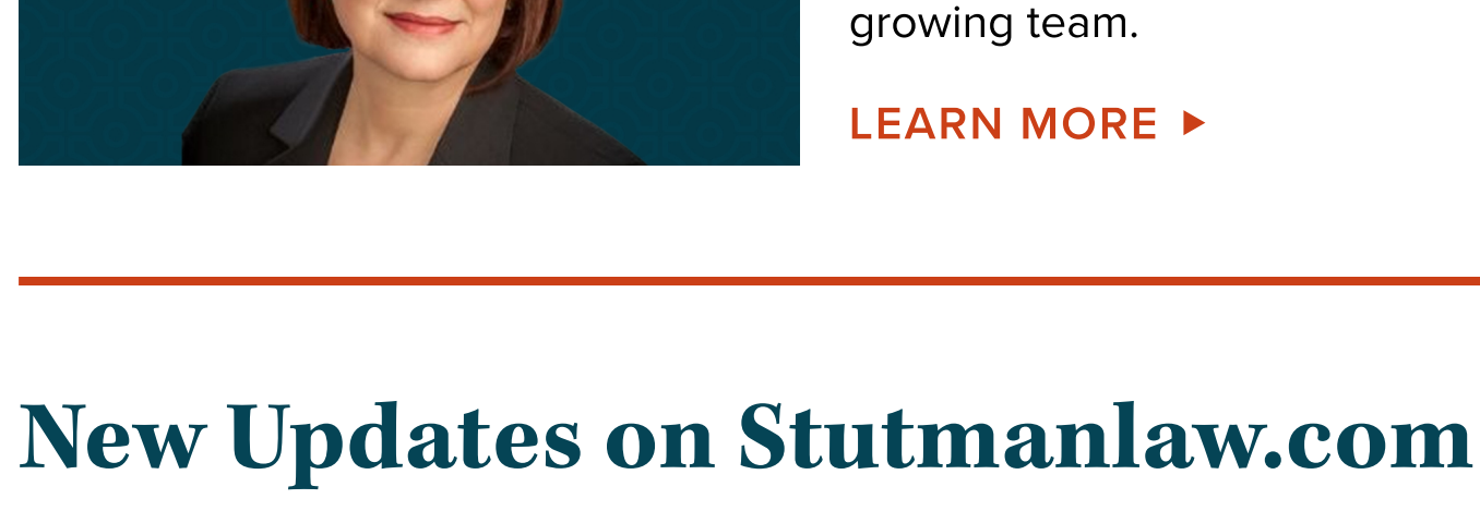
LEARN MORE ▶