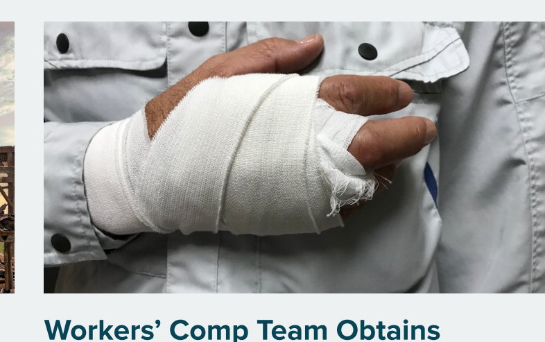
Maximum Recovery Allowed Under Massachusetts Law