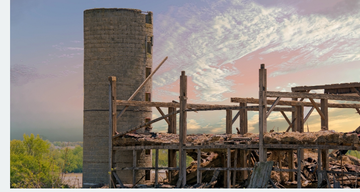
Into Settlements Through Aggressive Investigations