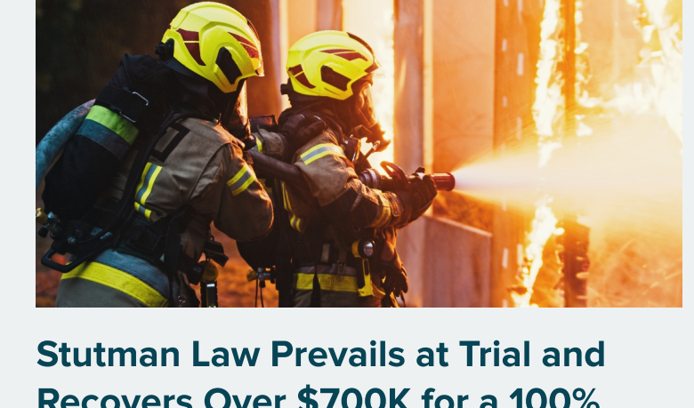
Recovers Over $700K for a 100% Recovery